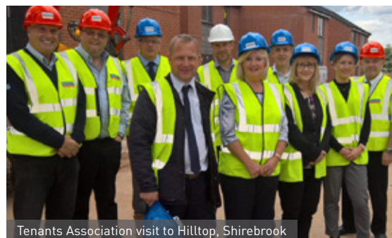
Tenants Association visit to Hilltop, Shirebrook