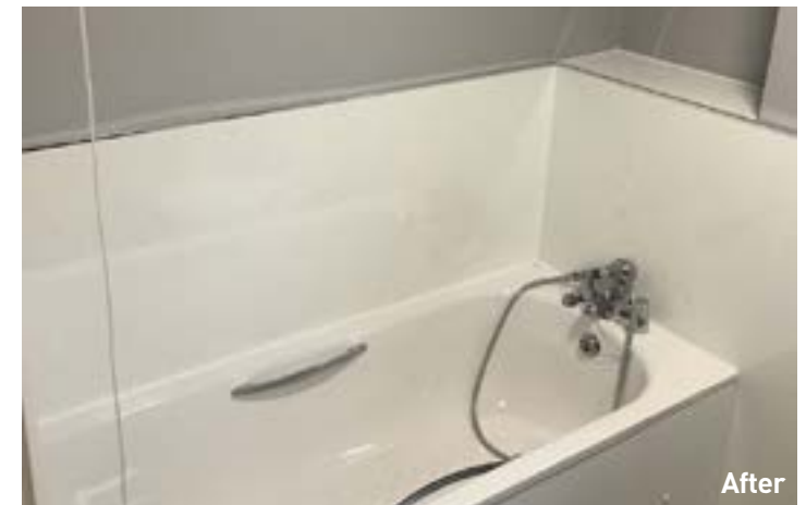
3 sided bath with Multipanel White Snow from the Classic Collection