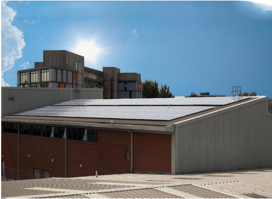
Multipanel's Head Office solar panel roof

Find out more at www.multipanel.co.uk/accreditations and https://www.multipanel.co.uk/about-multipanel/responsibility/